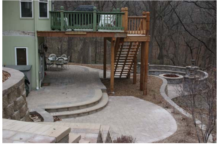
The renovated deck was just the beginning.