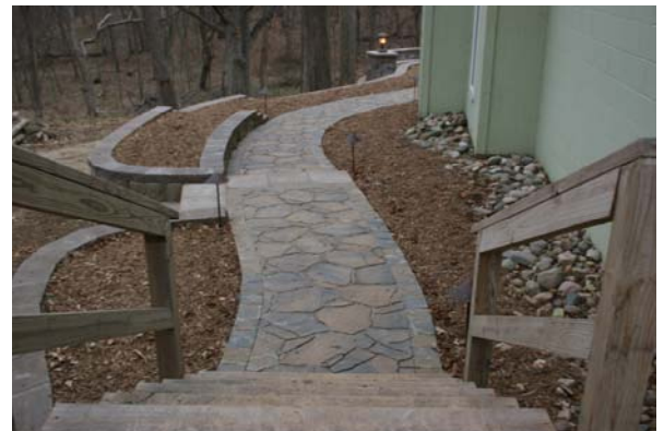
A more finished look. This pathway wanders the perimeter of the house. Can't wait to see the landscape beds in bloom next year!