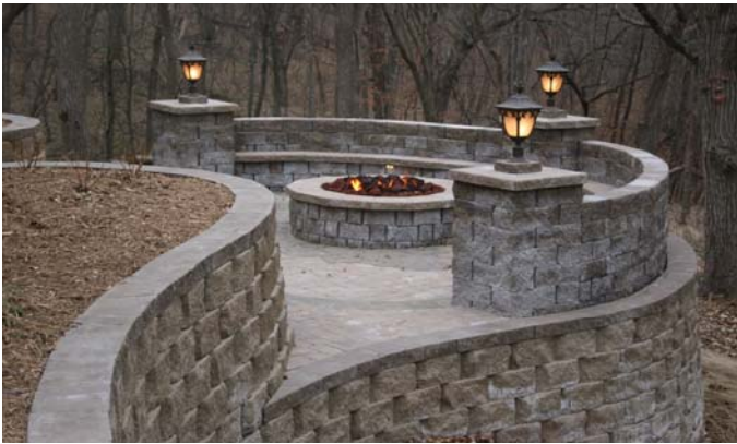
The fire pit is a great conversation spot and the seat wall is the perfect place for reflection or rest after a hectic day.