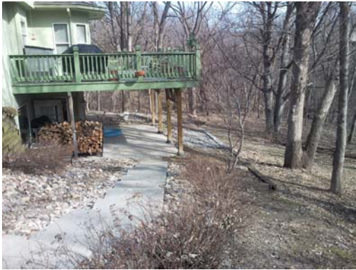
Where we started

We wish you and yours a happy, healthy and prosperous 2011.