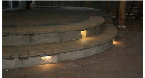
Illumination is a safety feature and adds to the space's functionality once the sun sets.